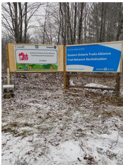
Signage showcasing the funding along the trails.