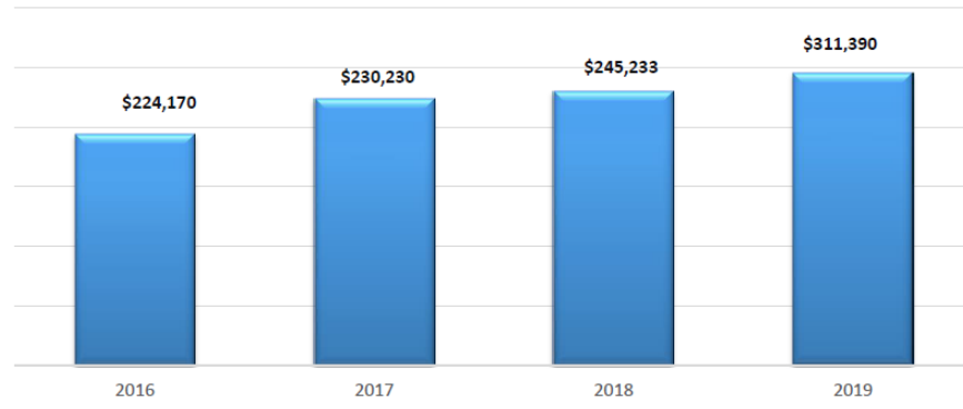
Dollar Value of Permits Sold 4 Year Trend

Between the EOTA shared use permit sales and the local snowmobile clubs/districts permits, over $550,000 dollars from user pay is brought in to help support trails.